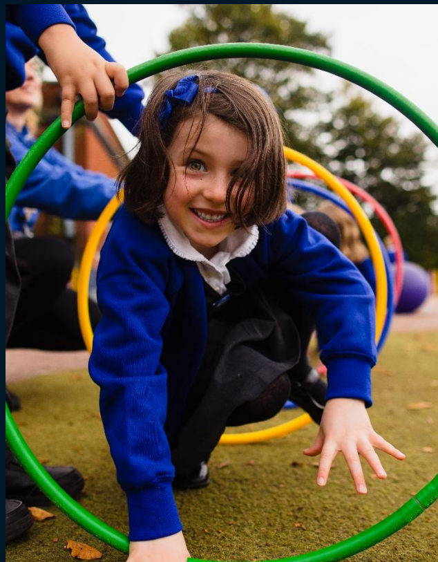
Solent Junior School Ofsted GOOD – March 2025