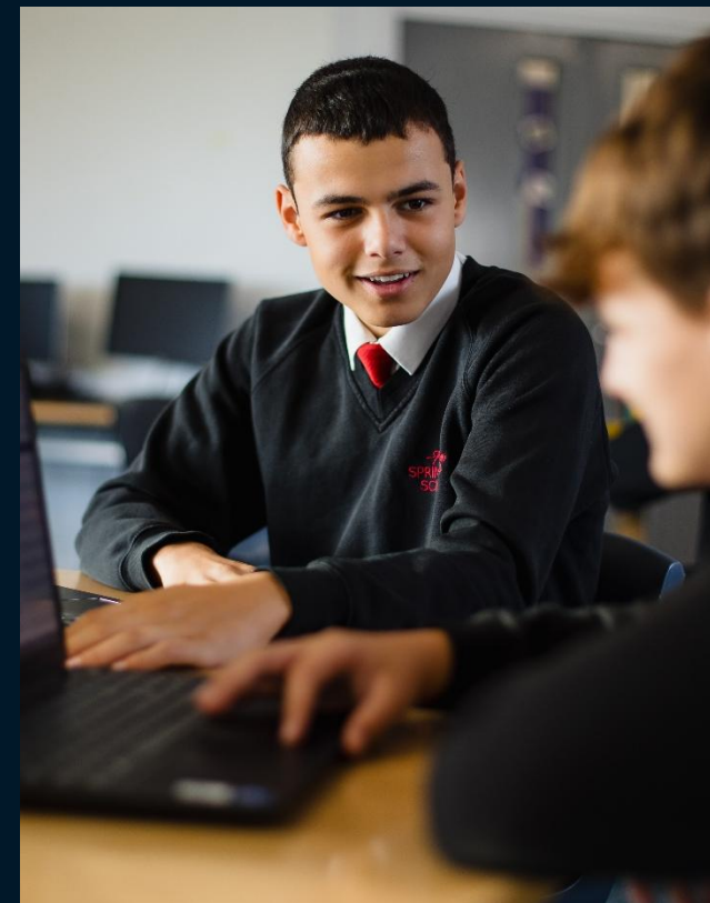
Springfield School (11-16) Ofsted GOOD – April 2025