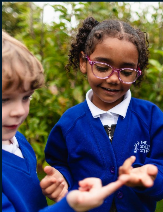
Solent Infant School Ofsted GOOD+ May 2025