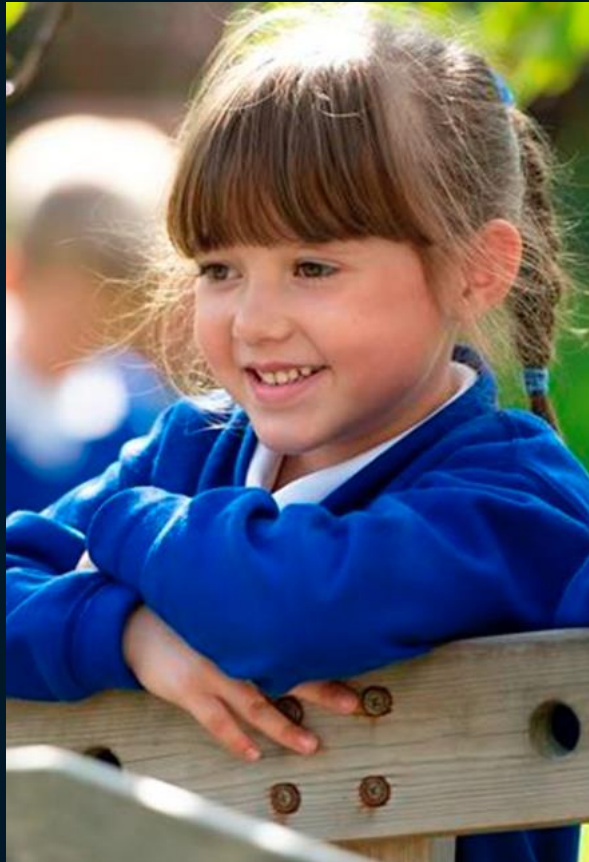
Solent Infant School Ofsted GOOD – Feb 2020