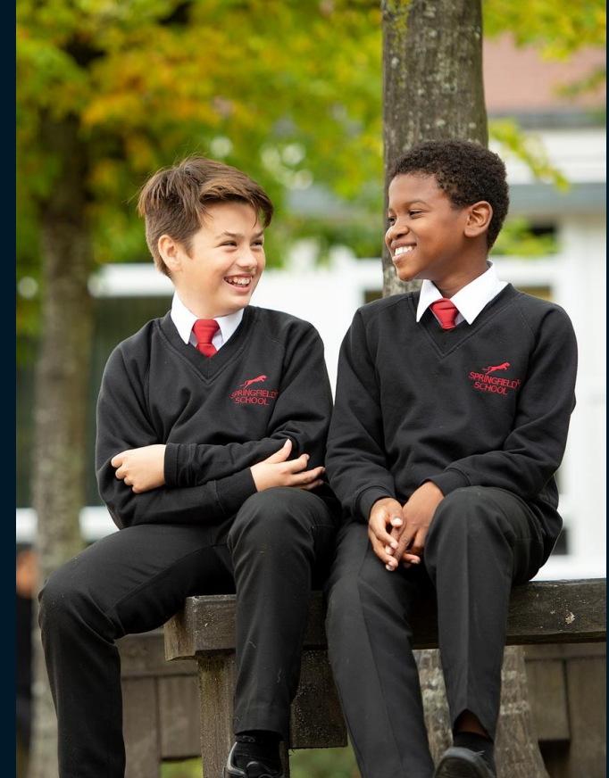
Springfield School (11-16) Ofsted GOOD – Oct 2019