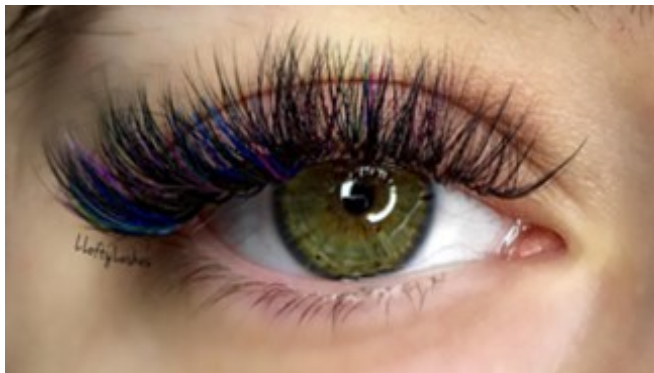
FALSE EYE LASHES/LASH EXTENSIONS